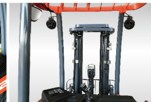
Great visibility for improved operation and safety