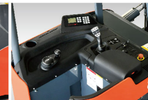
Operator station provides comfort and efficient operation