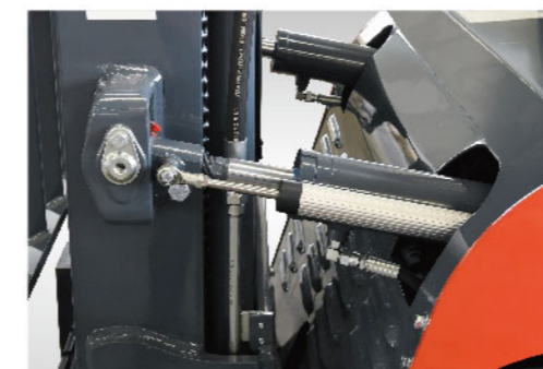
Optional intelligent security control system adjusts tilt angle and speed for improved safety